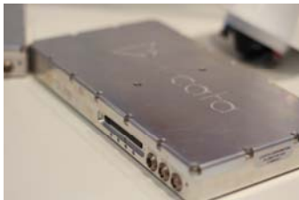
Locata (1 of 3).jpg

In this image Mr Gambale is holding a LocataLite with the outer cover removed to show the inner electronics of the unit