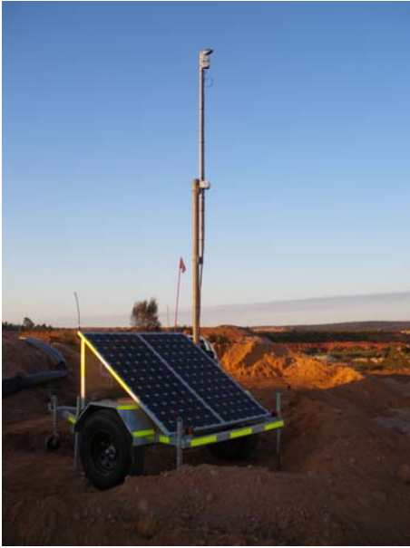
Leica Geosystems LocataLite.jpg A movable LocataLite at the WA mine.